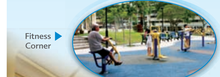
▶ Fitness Corner