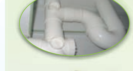
◀ Waste Discharge Stack