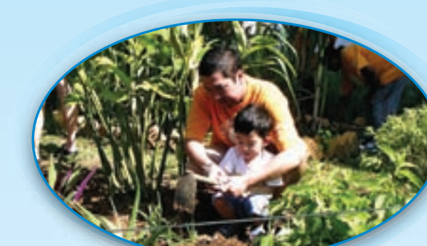
▲ Community Garden

Encourage greater residents' participation through public consultation. Residents will decide collectively on the facilities and improvements to enhance their neighbourhood.