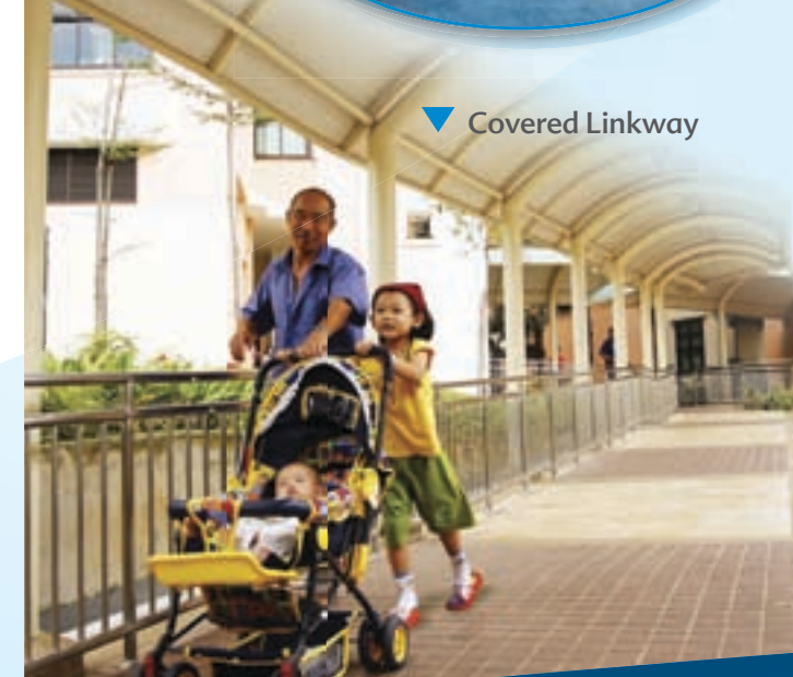
▼ Covered Linkway