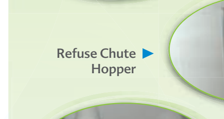
▶ Refuse Chute Hopper